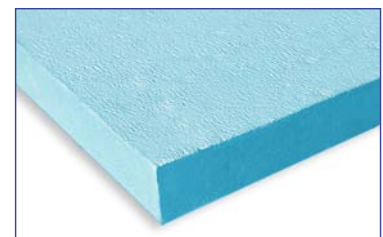
Polystyrene foam core